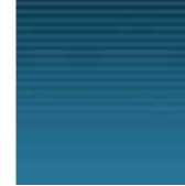
Premium Office Suite